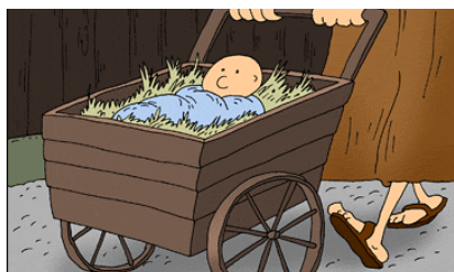
THE "MANGER-ON-THE-GO" WAS BY FAR THE TOP SELLING STROLLER IN BETHLEHEM THAT YEAR